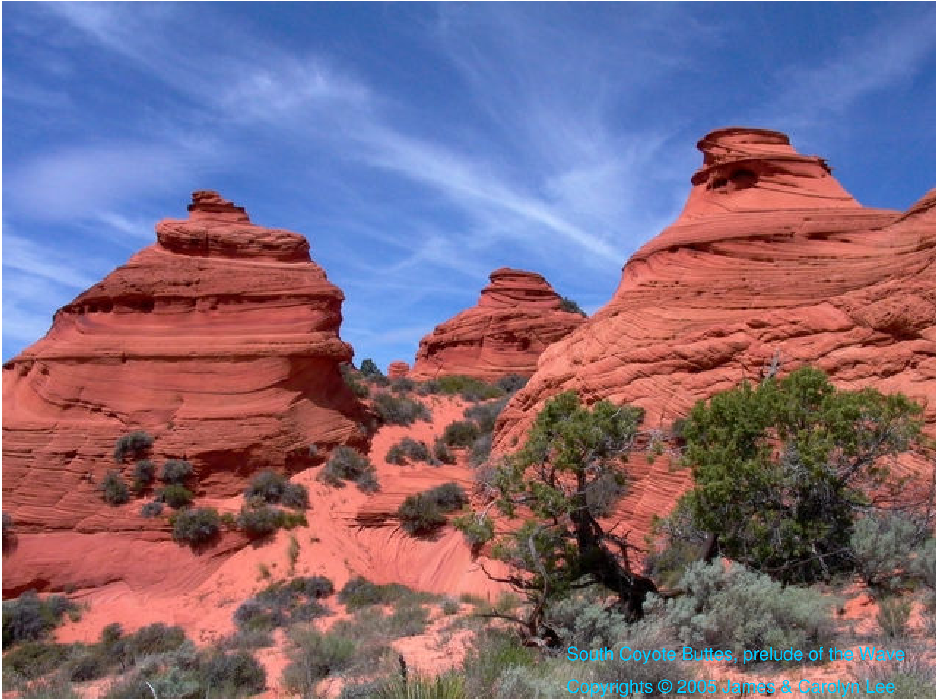
South Coyote Buttes, prelude of the Wave