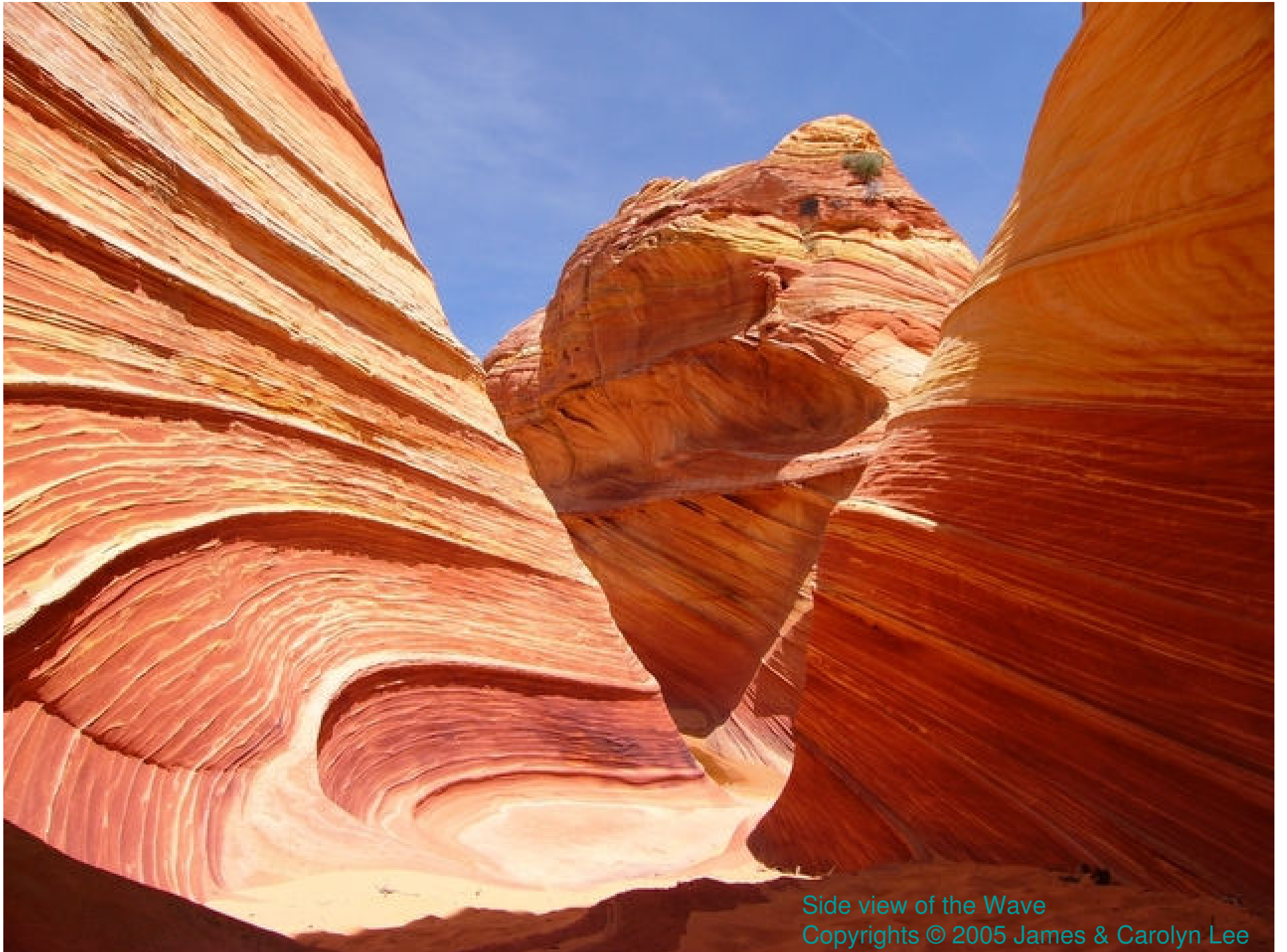
Side view of the Wave