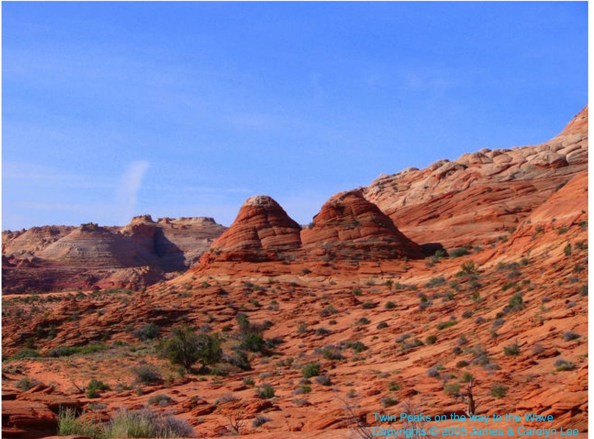
Twin Peaks on the way to the Wave