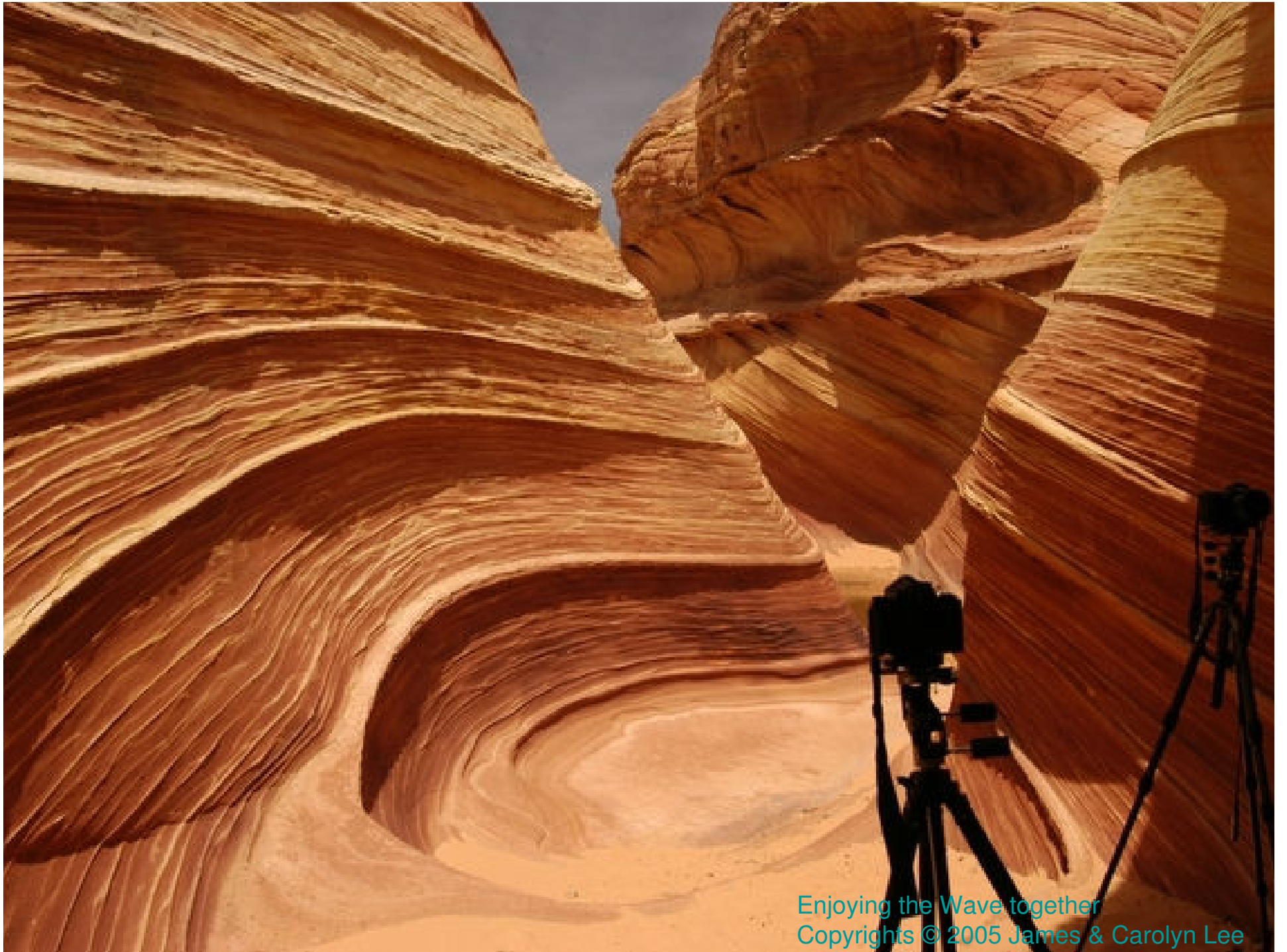
Enjoying the Wave together