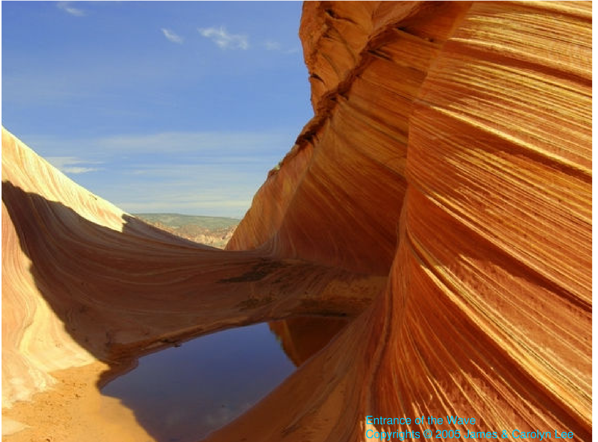
Entrance of the Wave