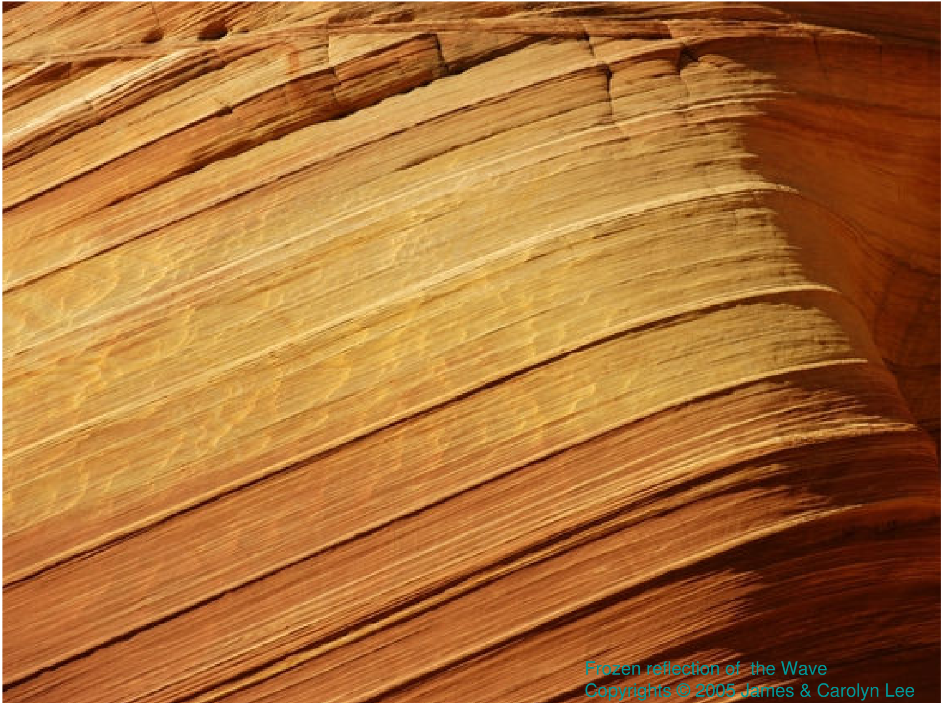
Frozen reflection of the Wave