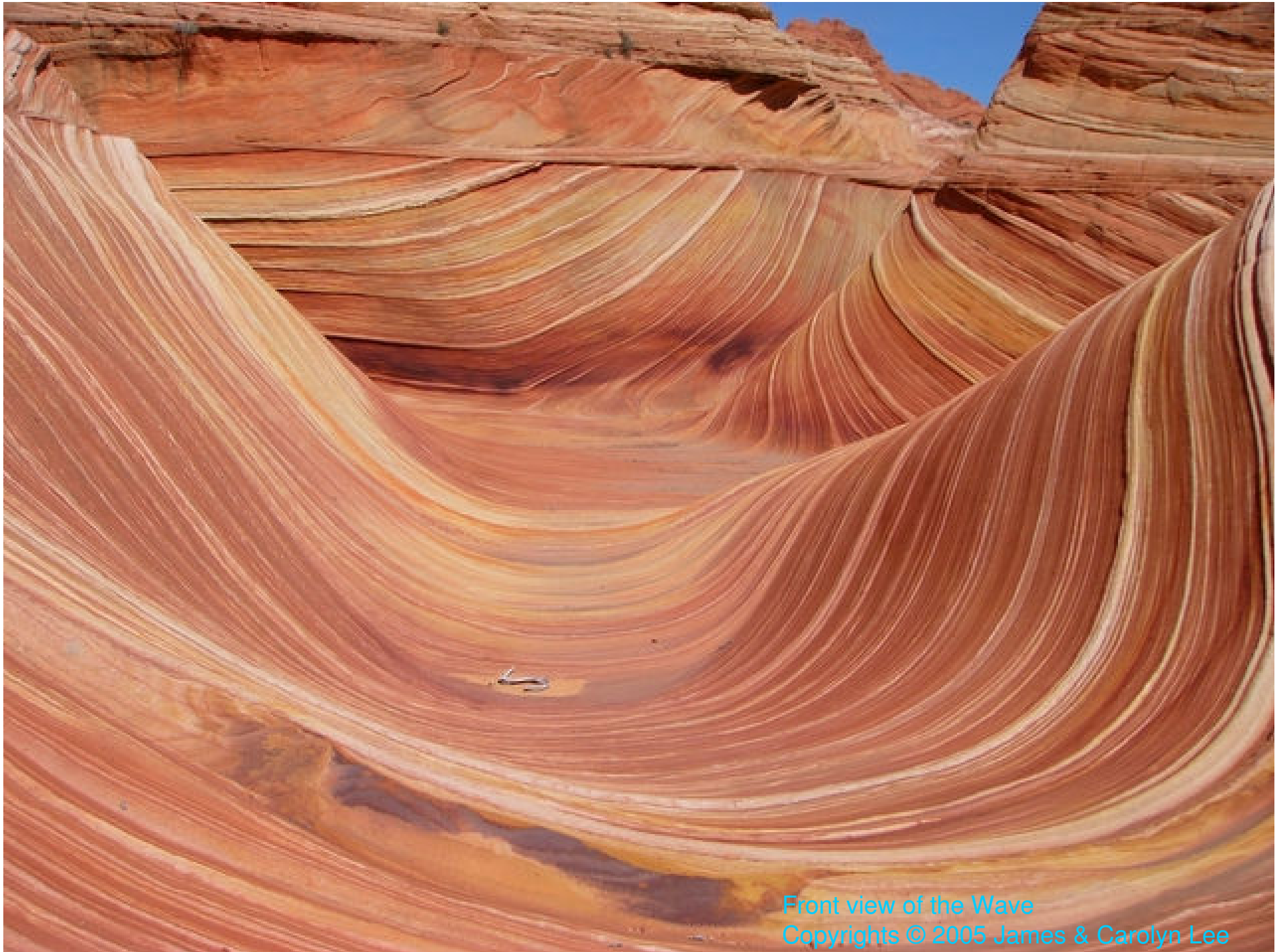
Front view of the Wave