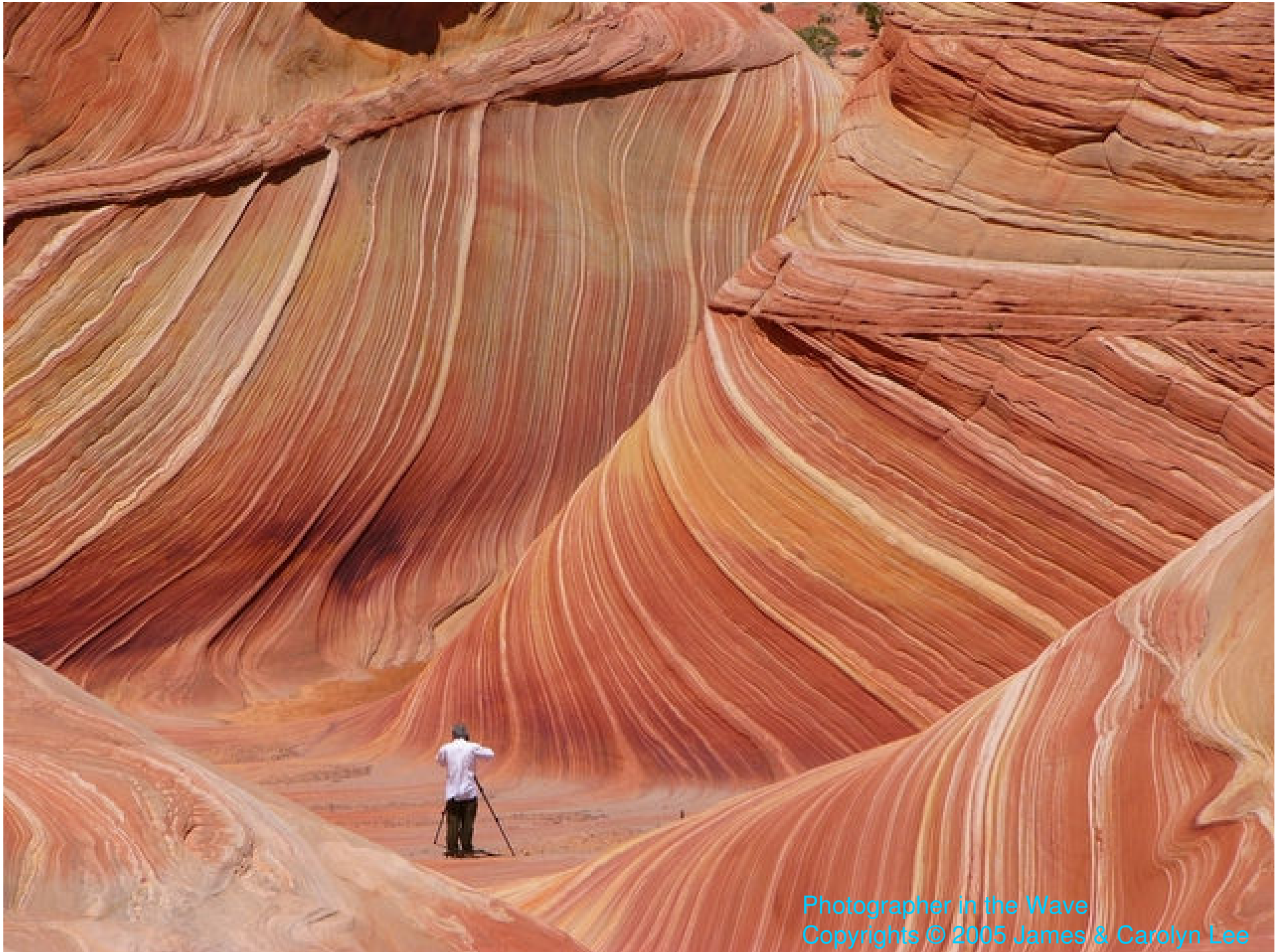
Photographer in the Wave