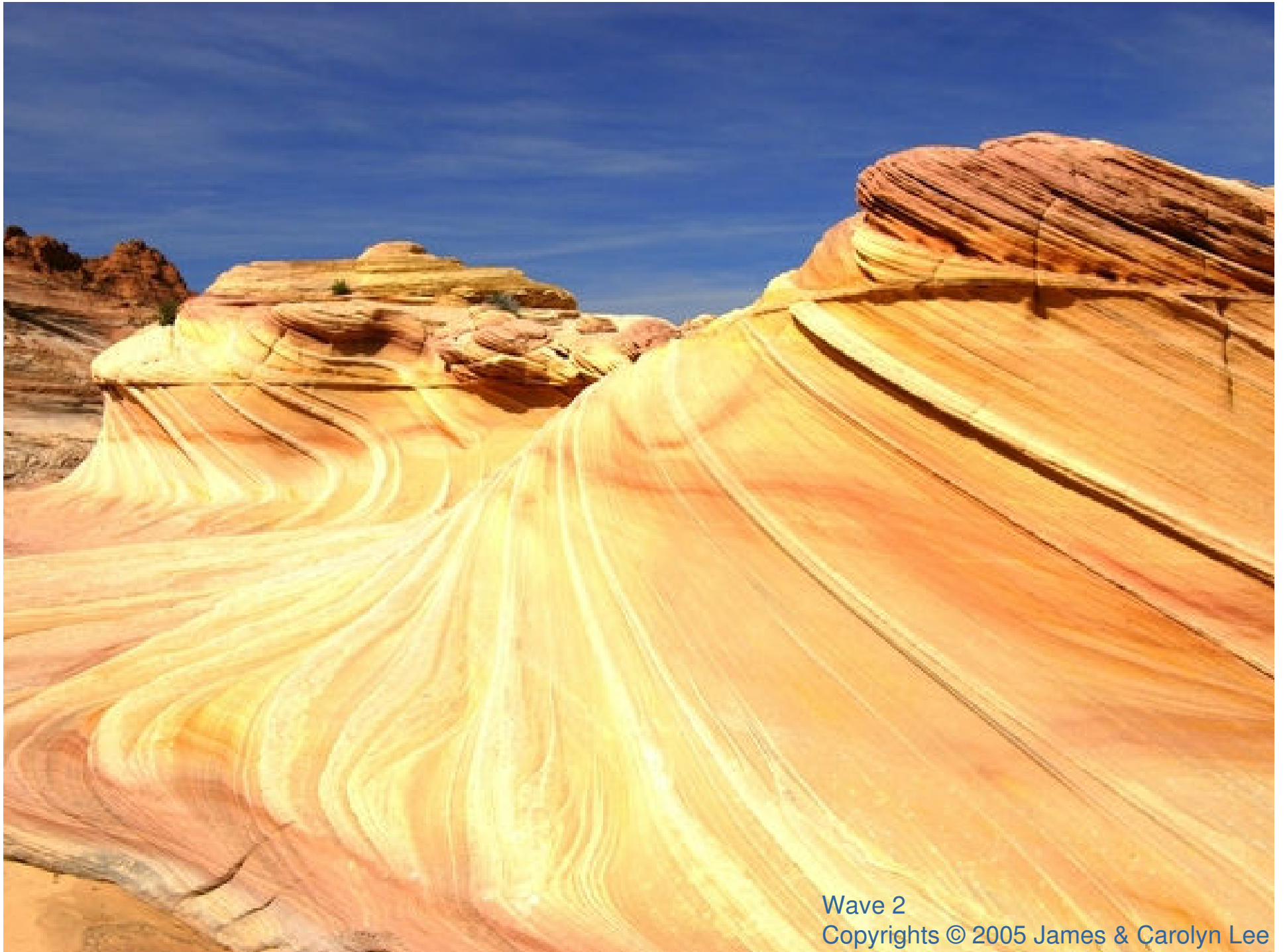
Wave 2