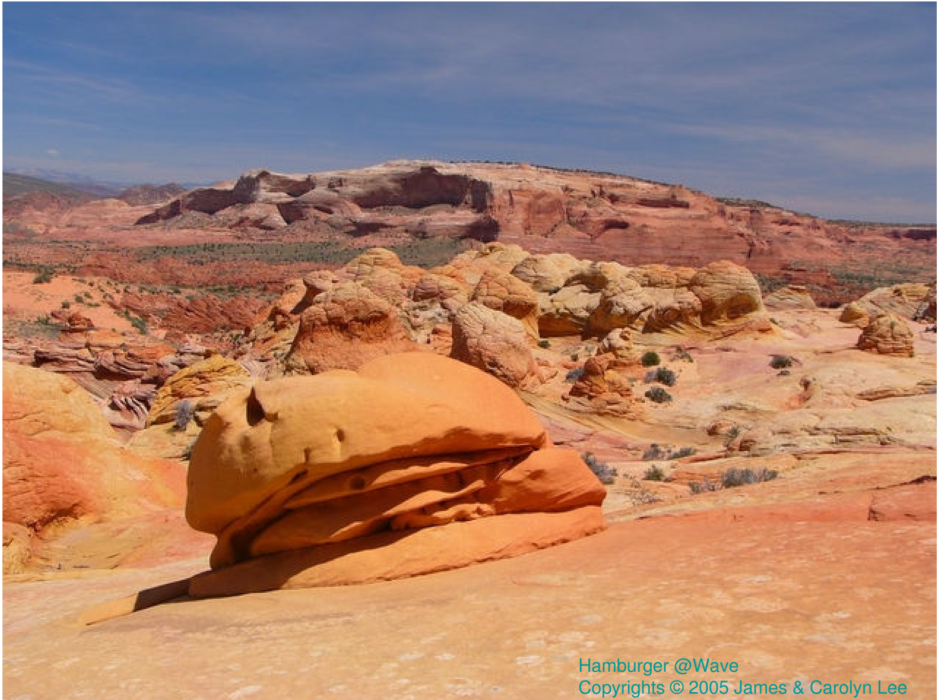
Hamburger @Wave