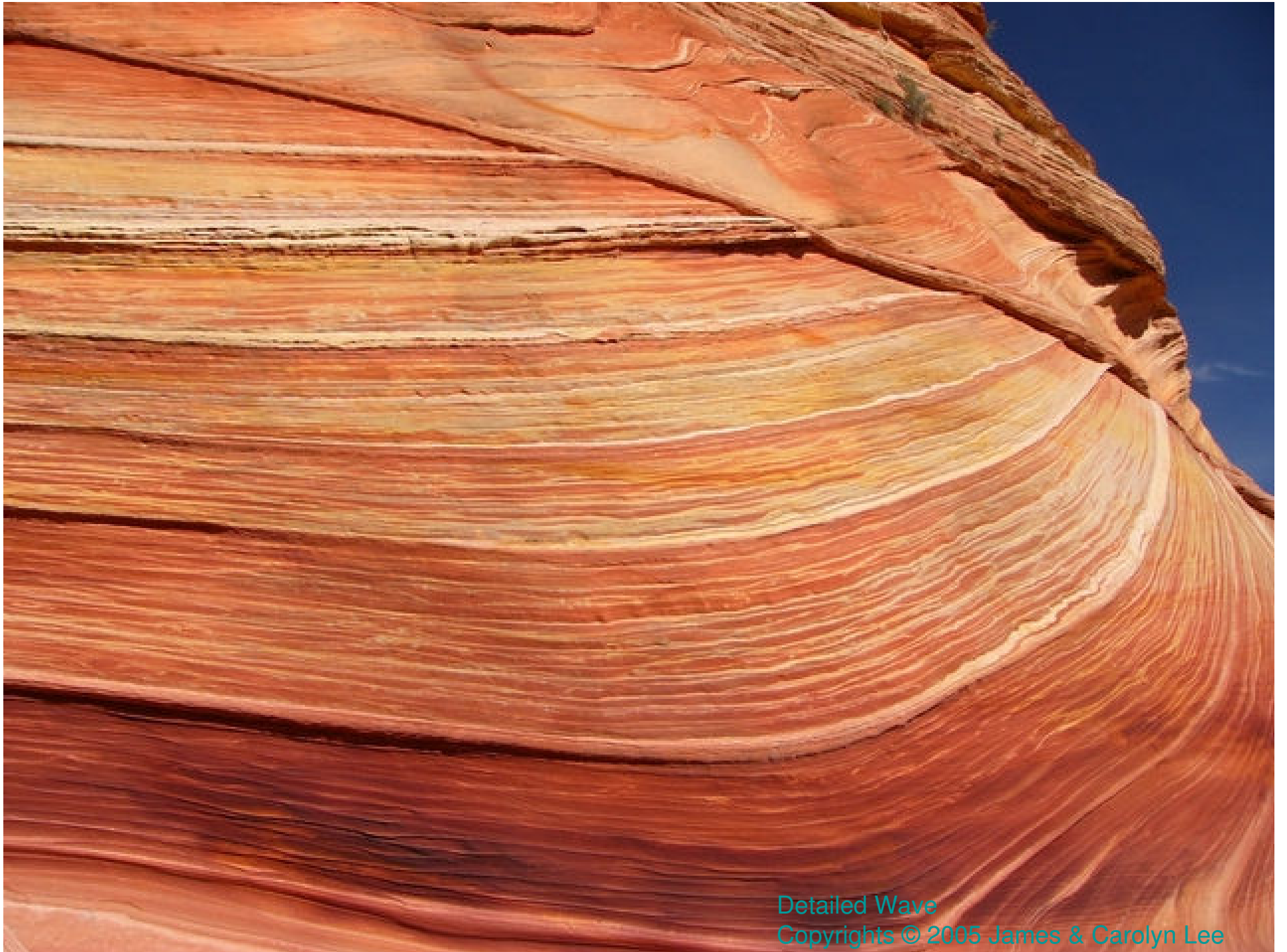
Detailed Wave