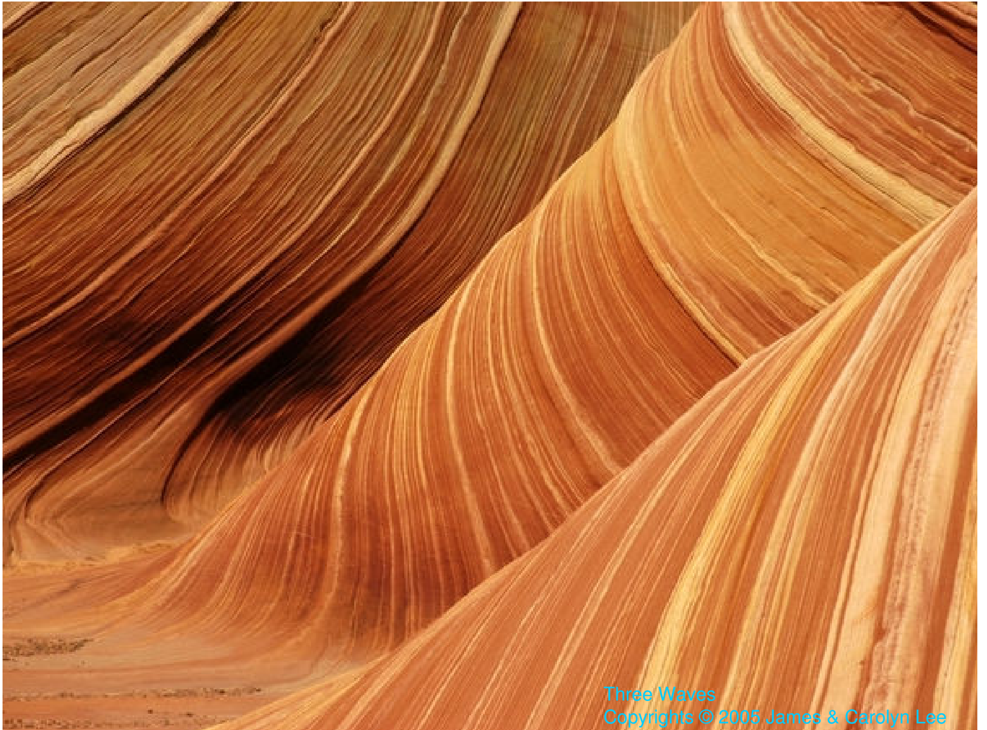
Three Waves