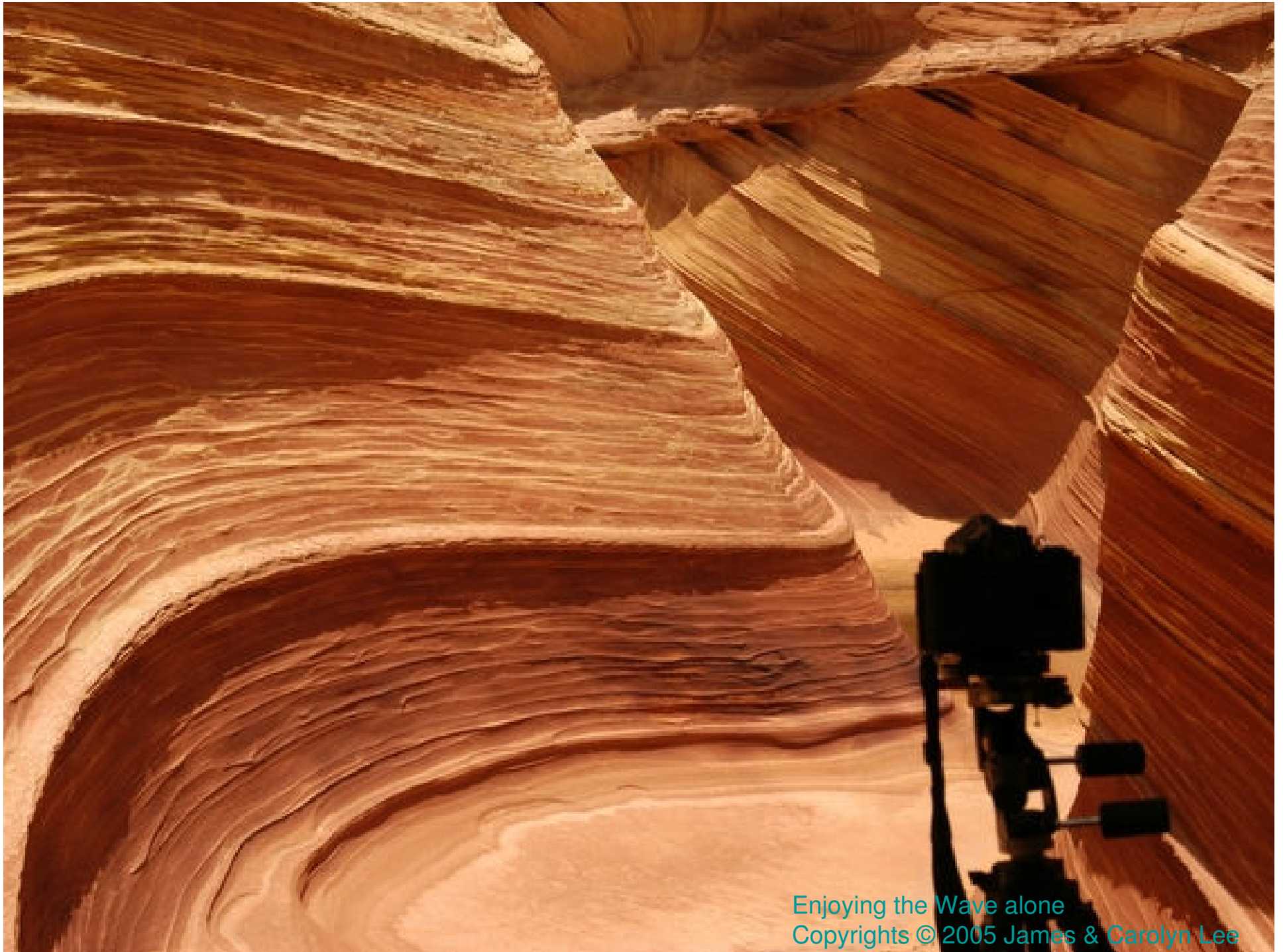
Enjoying the Wave alone